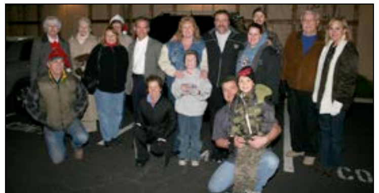
ESCA's Christmas Lights Tour 2008