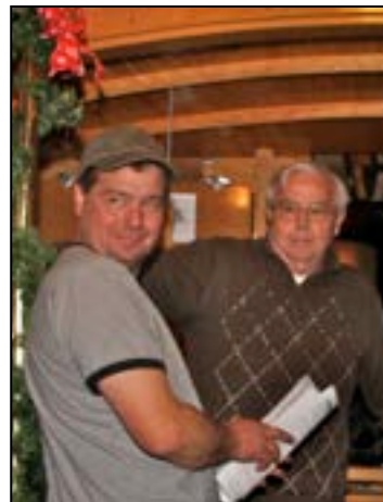
ESCA's Christmas Lights Tour 2009

We hope Chuck knew how much we appreciated the three years of Rosie the Trolley Tours !